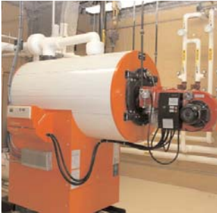
The condensing gas-fired boiler plant, sporting a burner that is a low NO x model, serves approximately 80 radiant zones.

In-slab radiant heating was installed instead of numerous ceiling-mounted gas-fired heaters. And separate electric and boiler rooms were installed in the shop area. The overall radiant system includes 16 main manifolds with 9 miles of cross-linked high-density polyethylene tubing.