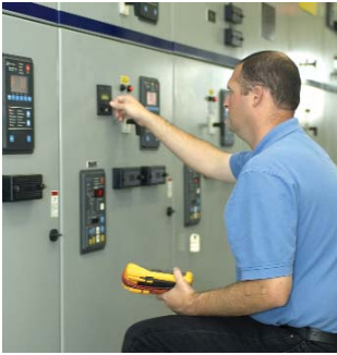
Dome-Tech engineer checking a meter at New Jersey American Water.