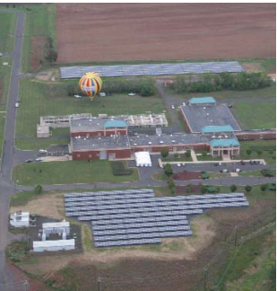
The NJAW solar photovoltaic energy system was completed in September 2005. On a cloudless, sunny day, the solar energy system will, in one hour, generate energy equivalent to that needed to run lights, air conditioners, and other electric power appliances in 500 homes.

and the help of rebates and incentives from New Jersey's Clean Energy Program, NJAW found a solution. Pump projects included complete pump replacements with high efficiency designs; pump retrofits and repairs; high efficiency motor and variable frequency drive installations; and the re-powering of pumps using natural gas engines (utilizing waste heat for building heating).