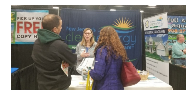
The Outreach Team promotes NJCEP programs at the New Jersey Home Show