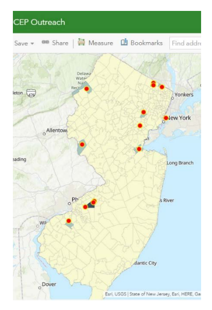
Sample Geographic Outreach Tracking Output

BPU access will be provided to view one-page overviews of the events in real time, as well as maps of where different types of events are taking place around the state. This enhanced GIS application tool will provide a new level of regional visualization that will be used for internal planning and included in quarterly reports back to the BPU.