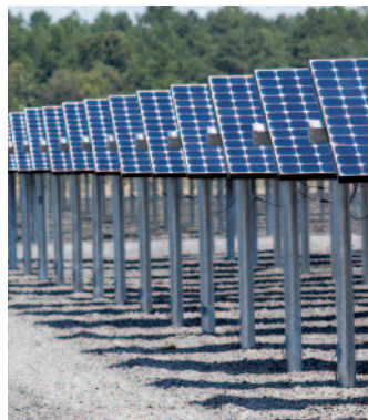
A side view of the Vineland Solar One 4.1 MW-DC solar system.

“We are pleased to be a part of a forward-looking and fiscally responsible partnership. The greening of America needs to start now, with viable projects like this one.”