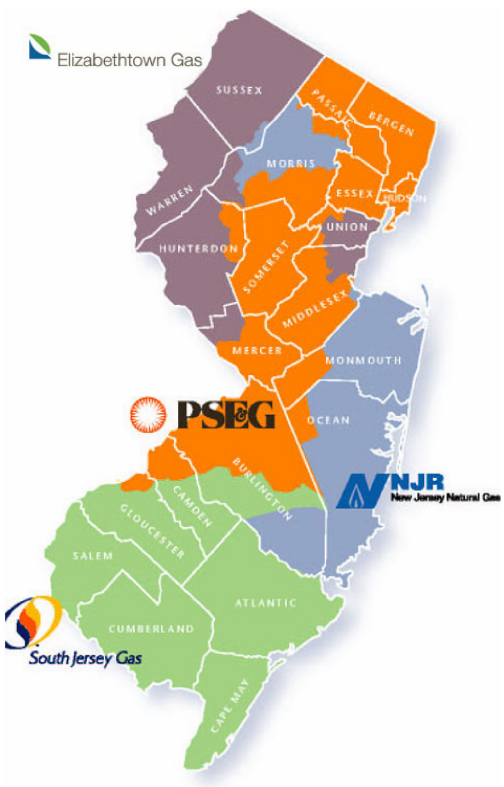
For more information, please visit the website @ www.njcleanenergy.com/ssb