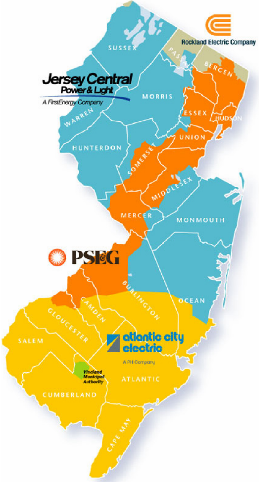
Atlantic City Electric Company is now known as Atlantic City Electric