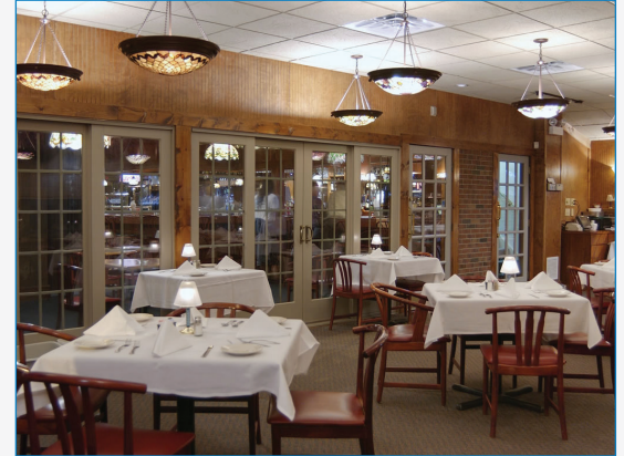
Installing more than $14,000 in dimmable LEDs allowed Library IV to replace incandescent light fixtures in its four dining rooms without sacrificing the restaurant's ambiance.

Those concerns were addressed with help from New Jersey's Clean Energy Program™ (NJCEP). Through the Direct Install program, O'Keeney was able to find lighting replacements that matched the style, color and light intensity of his existing fixtures. The program's incentives also made it possible