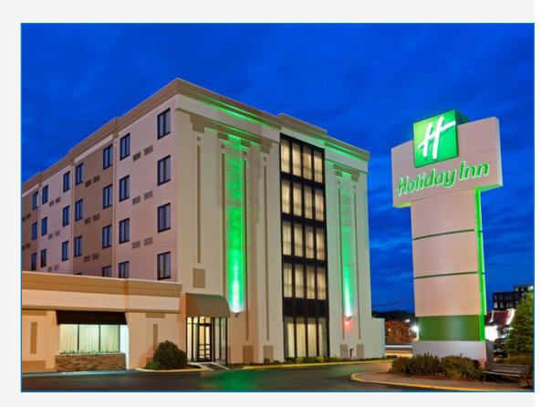
The Holiday Inn Hasbrouck Heights-Meadowlands hotel installed LED lighting throughout the hotel's guestrooms, banquet halls, restaurant and public spaces.

The Holiday Inn Hasbrouck Heights-Meadowlands in Hasbrouck Heights, New Jersey had plans to comply with one of the IHG Green Engage solutions requiring