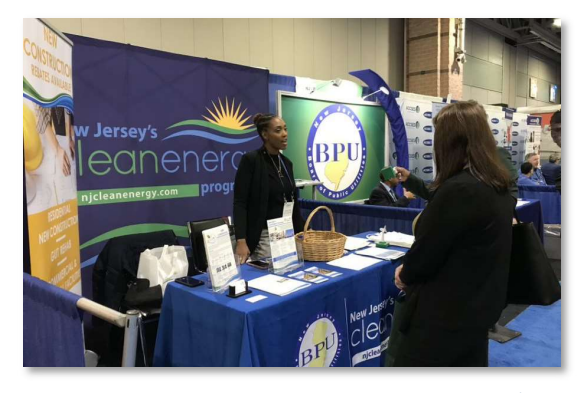
The New Jersey League of Municipalities' 107<sup>th</sup> annual conference provided meaningful face-to-face networking and a showcase of BPU and NJCEP programs in a post-COVID-19 environment

An Account Manager will coordinate LGEA organization outreach efforts with the of informational campaigns, development of newsletter content, and involvement in annual Organizational involvement will conferences. continue with the Association of Counties, Conference of Mayors, School Buildings and Grounds Association, School Boards Association, and League of Municipalities. Equitable outreach for targeted overburdened towns and authorities will be included during FY24.