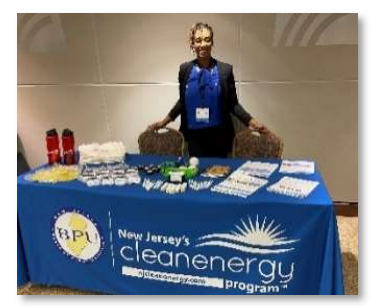
TRC exhibited at the Association of New Jersey's Environmental Commission's 49th Annual Environmental Congress, their first in-person event since the COVID-19 pandemic