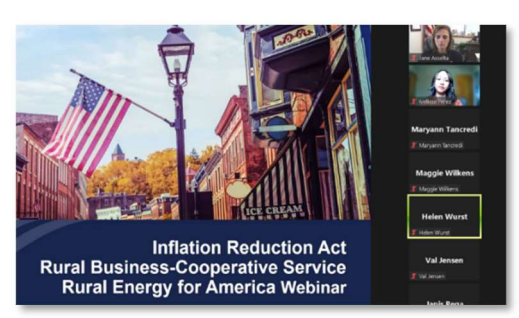
TRC coordinated and participated in a joint virtual presentation with the US Department of Agriculture