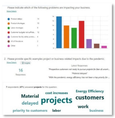
FY22 Trade Ally Survey

A series of contractor and rater trainings will be developed to address various areas of interest, including benefits to the contractor and customer, program overview, and how to fill out the applications. Trainings will offer short and streamlined messaging that will be recorded and saved on the program website and Clean Energy Learning Center in the form of short vignettes for future reference. The Trade Ally Manager will create and deliver content for the training presentations. In FY22, the Trade Ally Manager coordinated several application training and program overview webinars that were posted to The Clean Energy Learning Center.