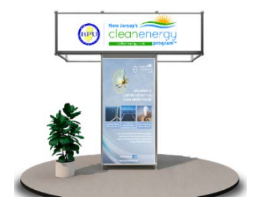
TRC coordinated and attended a virtual booth for the New Jersey School Boards Association's annual conference. The conference was virtual due to COVID-19 precautions.