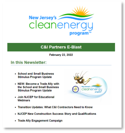
Monthly Eblast Newsletter