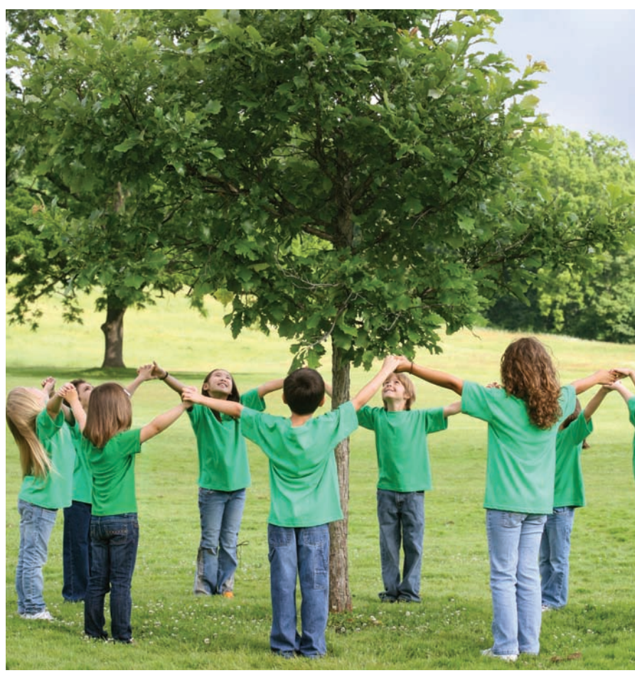
A Commitment to the Future.