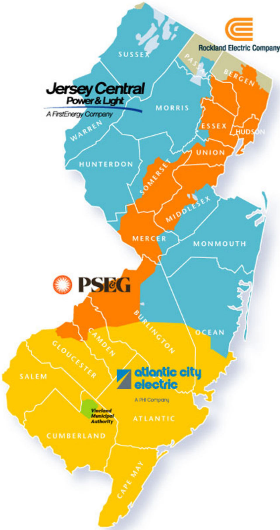
Atlantic City Electric Company is now known as Atlantic City Electric