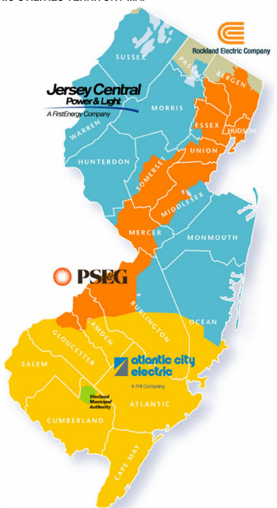
Atlantic City Electric Company is now known as Atlantic City Electric