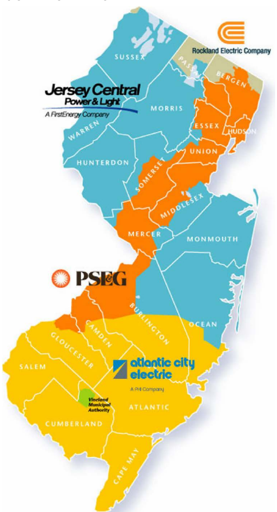
Atlantic City Electric Company is now known as Atlantic City Electric