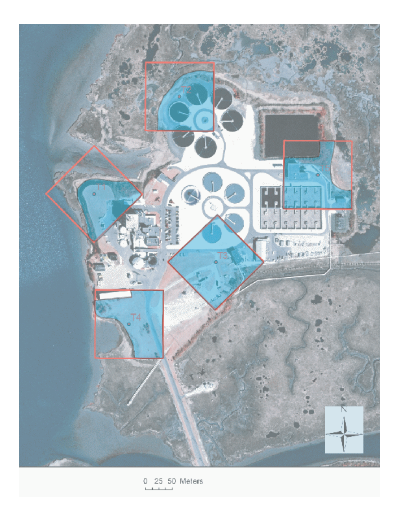
Figure 1. Atlantic City Utilities Authority (ACUA) study site showing actual survey areas (shaded in light blue) used during collision incident surveys. Low lying marsh areas within a turbine's search area were not surveyed because tidal inundation regularly prevented access to these sections. To some extent this was the case at all turbine sites except at turbine #3. If a building fell within the search area, rooftops were surveyed when accessible. Clarifying and mixing ponds, and other water bodies were also surveyed using walkways, gangways and dikes to gain access.