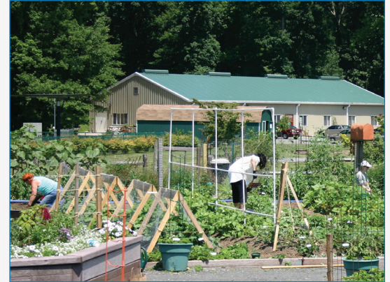
Middlesex County's Agricultural Extension building provides office space for the EARTH Center in Davidson's Mill Pond Park (pictured above). Energy efficiency improvements reduced monthly utility expenses by half.